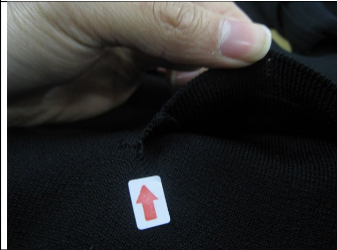
Insecure seam stitch